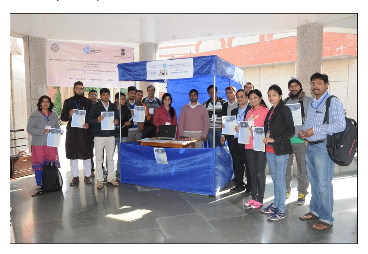
Participants of winter school at IEEE CIS Membership Drive stall