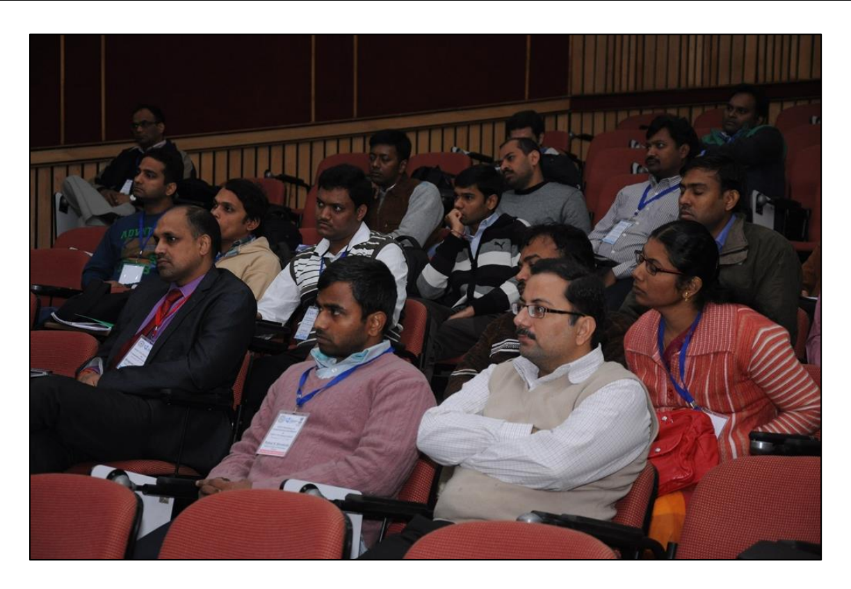
Winter school participats at inaugural ceremony, Outreach Auditorium, IIT Kanpur, India