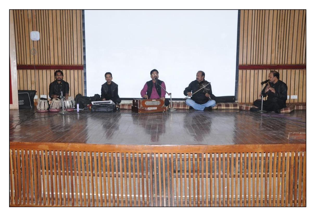
Musical performance by artists at Outreach Auditorium, IIT Kanpur, India during winter school