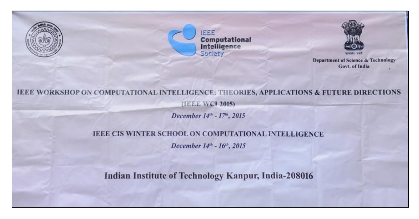
2015 IEEE CIS Winter School on Computational Intelligence at Indian Institute of Technology Kanpur, India held during December 14^{th} - 16^{th} , 2015