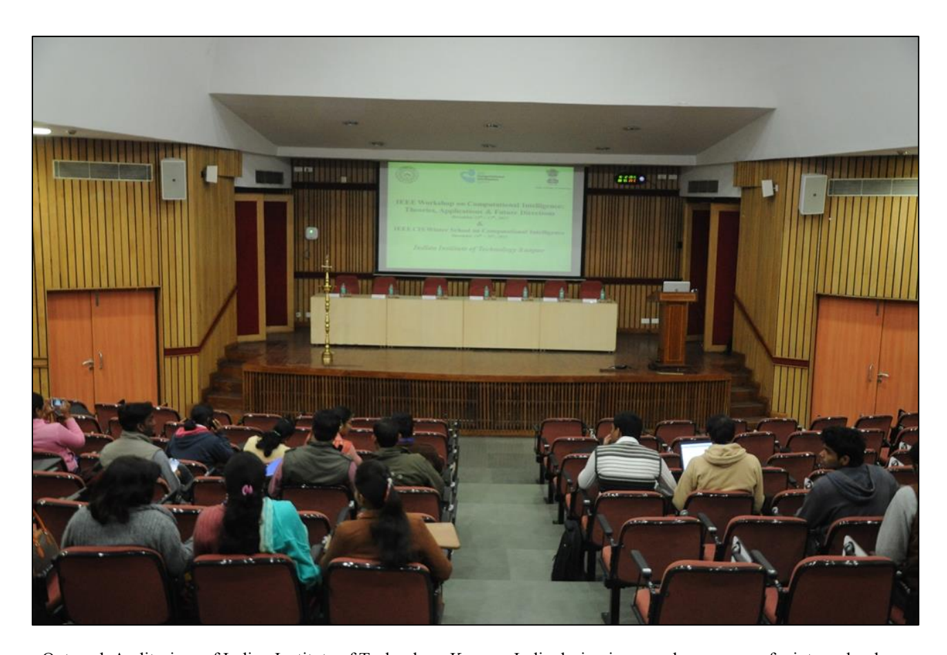
Outreach Auditorium of Indian Institute of Technology Kanpur, India during inaugural ceremony of winter school