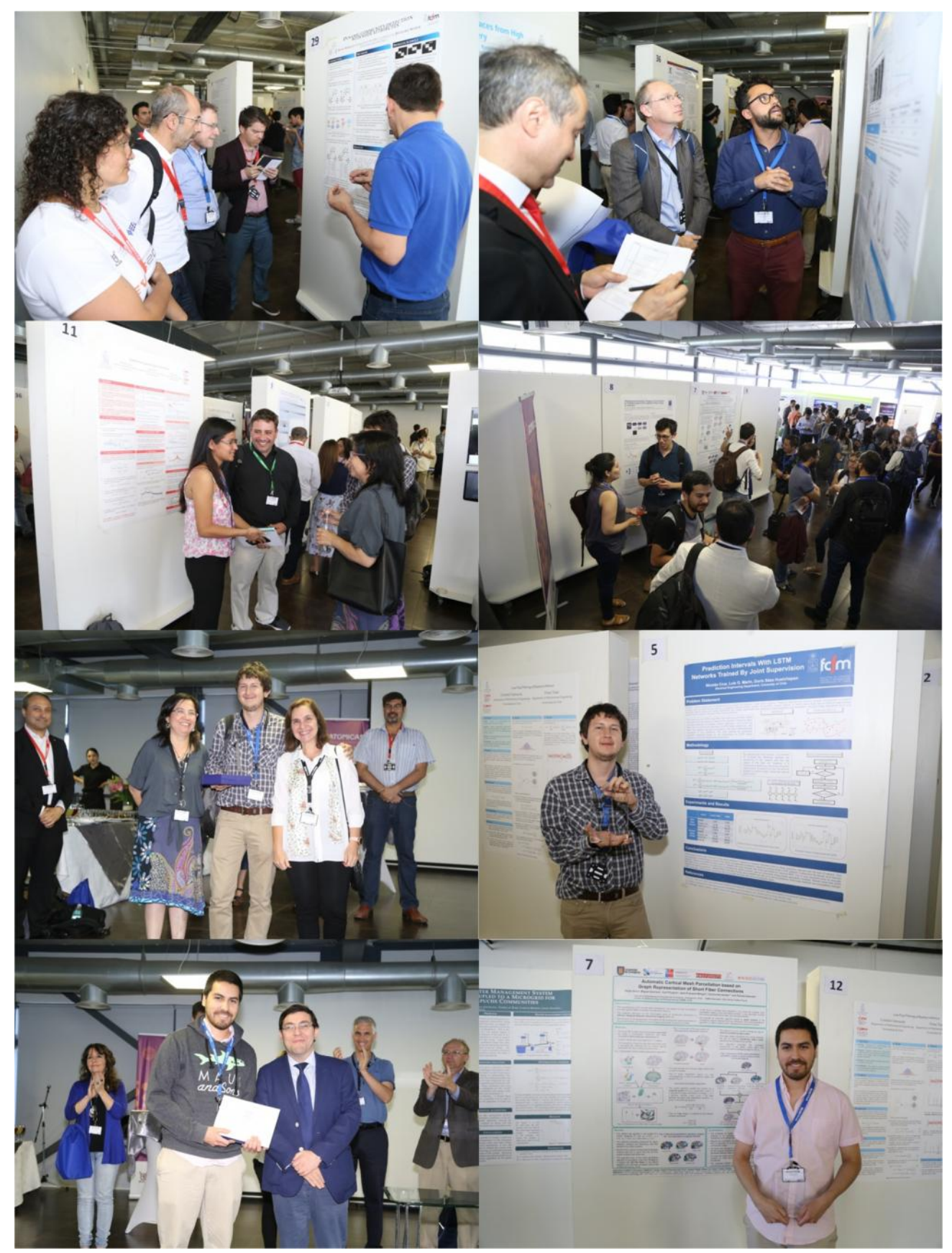
Student poster competition: Juries in action and winners, at EVIC 2018, Universidad de Santiago, Chile.