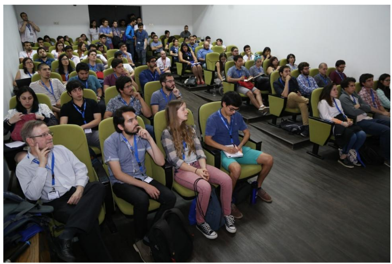
Well attended tutorial at EVIC 2018 in one of the the VIME building rooms, Universidad de Santiago.