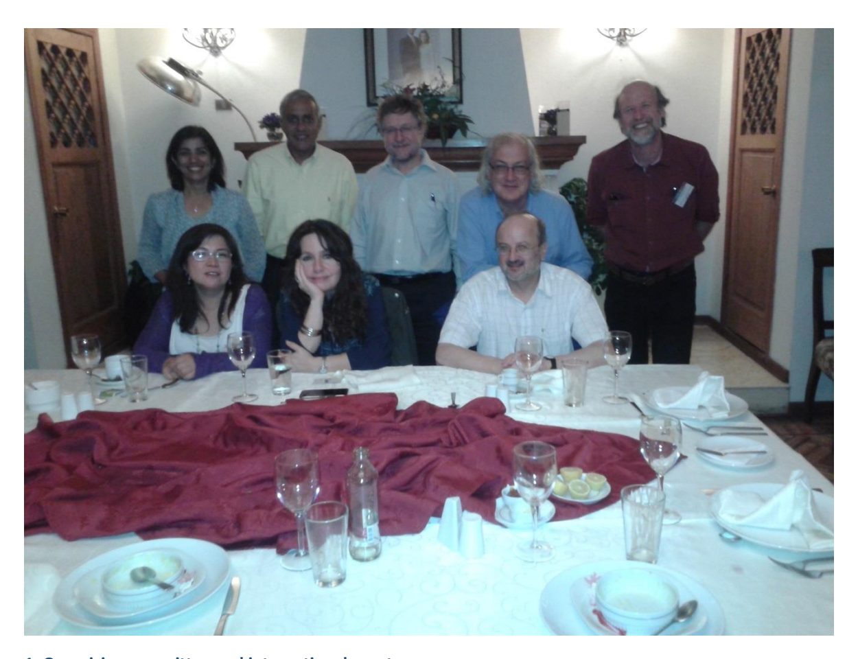
1. Organizing committee and international guests